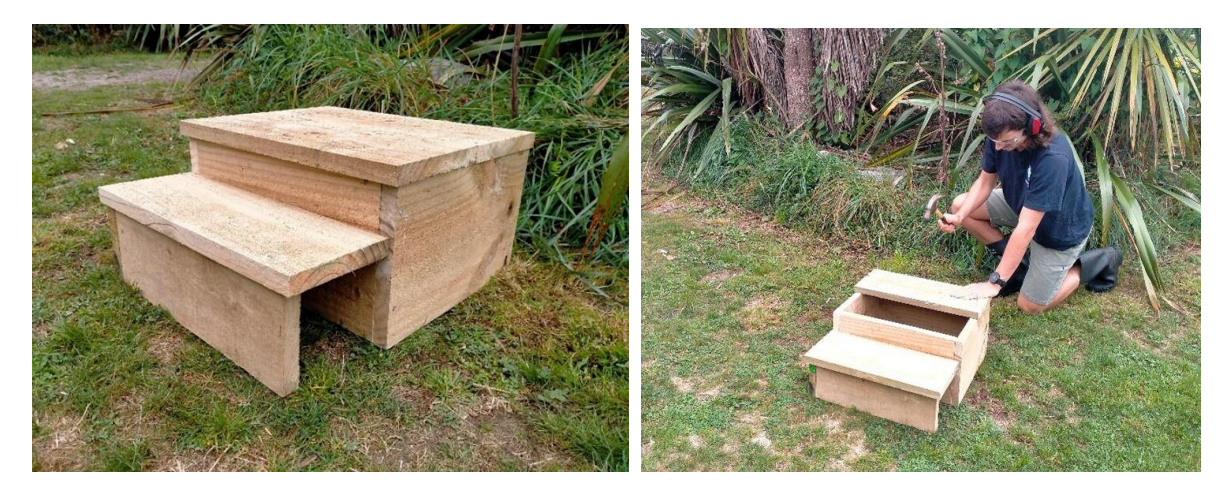
Figure 7: The external sideways tunnel designed by the West Coast Penguin Trust (left); Linden Brown building a nest box (right).

The dimensions of the nesting chamber are the same as the Oamaru design. The sharp turn from the tunnel into the nesting chamber is likely to deter cats and maybe weka as they are likely to be confronted with an angry penguin as turn the corner. The removable lid can be either the front or the back half of the roof, and it can be made tamper proof if required as illustrated above.